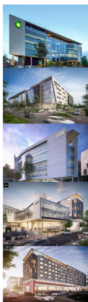
199 Oxford Completed: Dec 18