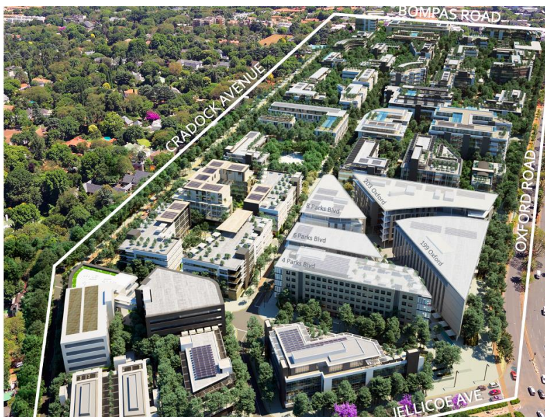
4 Parks Boulevard Complete: Feb 21

Oxford Parks is envisaged to be a sustainable & cosmopolitan medium-density urban environment that brings 300,000m 2 of mixed use development rights to this prominent area linking Illovo to Rosebank along Oxford Road in Johannesburg.